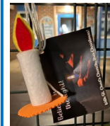
Knitted candles around town