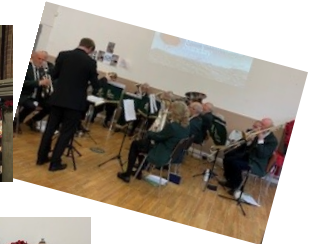
Pavilion Brass Band