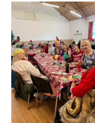
MCC Christmas Lunch