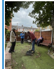
Work in church and gardens