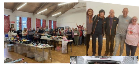
Over 600 shoeboxes and a visit from Teams4u.

2024 has been a mixed bag for St. Chad's. Work is continuing in the church, and we had lots of amazing events. Here's just a small assortment of pictures from the year.